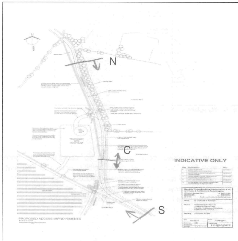
Fig 1 Location of traffic counters